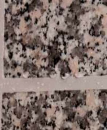
Sealing an external stone dressing

The surrounding temperature only has a small impact on the reticulation rate of Mapesil LM , while the level of humidity in the surrounding air has the most influence. We highly recommend that the product is never applied if the temperature is below 0°C.