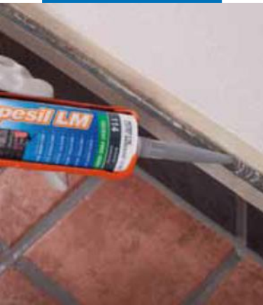
Sealing an internal stone dressing