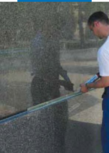
Sealing a façade joint with Mapesil LM