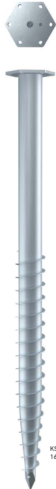
KSF M 89x 1600-M24