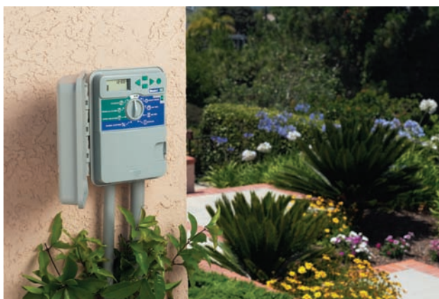
The outdoor version of the XC features a sturdy locking cabinet.

The XC controller brings peace of mind to installers and homeowners with a non-volatile memory that maintains the current program, plus correct day and time in the event of a power outage. The "Easy-Retrieve" memory holds the installers preferred program as a permanent backup that can easily be reinstalled over any temporary program changes made by end-users. In addition, the XC comes complete with a factory installed lithium back-up battery that can easily be replaced if needed. These features ensure that the correct irrigation program is always available and your valuable landscape stays in perfect condition.